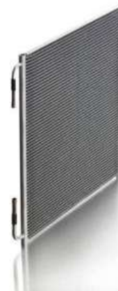
Figure 1: Microchannel Coil

See "Condenser Coil Options and Coating Considerations" on page 13 for discussion of environmental factors related to material and coating options.